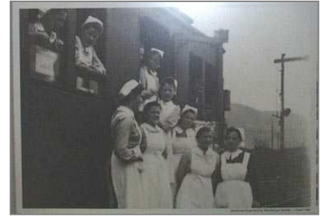
T-4 Nurses, Hadamar Institute

The Holocaust would evolve from a variety of sources, motives, and initiatives. A significant development was the T-4 “Euthanasia” program established in October 1939 by Hitler. The goal of this German domestic initiative was to destroy “lives not worth living” or more precisely, those genes/lives deemed a threat to the Aryan body. This was a culmination of early Nazi sterilization policy now given a new energy with the victory in Poland. The Nazis utilized the German public health service to carry out its program of “racial hygiene.” Victims, those seen as physically or mentally unfit and incurable, were identified from hospital records by a panel at the Tiergartenstrasse 4 address in Berlin. By 1945 over 400 state-run medical facilities and their professional