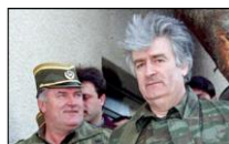
Ratko Mladić, Bosnian Serb military leader and Radovan Karadžić

1992 was the critical year in the unfolding atrocity. Radovan Karadžić, leader of the Serb Democratic Party in the Serb autonomous regions of Bosnia, established the autonomous state of “Republika Srpska” in northern and western Bosnia. He armed paramilitaries in preparation to fight for Milošević and began a campaign of “ethnic cleansing.” He threatened to bring the same “road to hell” in BiH as in Croatia