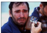
A father from Mitrovica in Kosovo shows pictures of his two children he fears to have been killed by Serbs during the war in Kosovo, 1999

Having lost three wars and hurt the economy, Milošević worried about his legacy. To save it, he decided to at least take back Kosovo. He attempted to “ethnically cleanse” Kosovo in 1998. In March 1999, after Serb forces had killed Albanian civilians, NATO issued an ultimatum demanding that the Serbs leave Kosovo. 50 Milošević ignored NATO the demand and NATO forces bombed Kosovo to protect the Albanian population. In response, Milošević ordered the Serbian army to attack Kosovo creating a mass expulsion of Kosovar Albanians. The Serbs conducted a campaign of ethnic cleansing in Kosovo as NATO bombed Yugoslavia for 78 days (March 24, 1999 to June 10, 1999). This NATO bombing marked the second major combat operation in its history, following the 1995 campaign in Bosnia and Herzegovina. In June 1999, Milošević finally gave in and was arrested for war crimes. Kosovo was divided between its various populations with