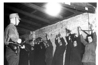
A Stormtrooper with accused Communists

Article 48 to suspend civil liberties. The "Decree for the Protection of Volk and State." ("Reichstag Fire Decree") enabled Hitler to suspend the constitution and curtail: personal freedoms; freedom of opinion; freedom of press; and the freedom to organize and assemble. It dramatically increased state and police intervention in private life: censoring mail, listening to phones, searches without warrant. President Hindenburg approved a new legal category "protective custody" ( Schutzhaft ) for political dissenters. All criticism of the government was