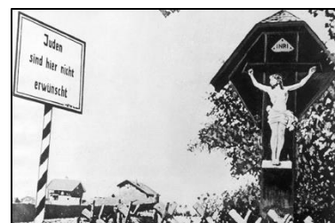
"Jews not welcome here." Nazi Germany, 1930s.