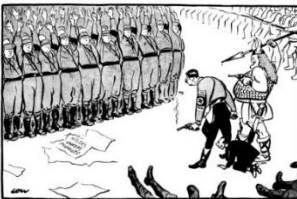
David Low, The Evening Standard (July 3, 1934)

Playing for time, Hitler persuaded Röhm to order the top SA leadership to take an extended leave on June 8, 1934. On June 17, Vice-Chancellor von Papen gave a speech at the University Marburg that was highly critical of Nazi failure to maintain the rule of law and seemed to expose Nationalist opposition to the regime. Partly to forestall the formation of a viable nationalist opposition, but primarily to maintain the professional army, which he had incorporated into his planning for rearmament and military expansion, Hitler decided during the last week of June to eliminate the top SA leadership and side with the elites. Once Hitler made his decision, the orders went out quickly.