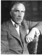
Franz von Papen

Chancellor Brüning was working against Schleicher's goals. Brüning convinced Hindenburg to ban the SA and SS and street violence dropped dramatically. However, President Hindenburg continued to resent taking action against nationalist groups. Sensing an opportunity Schleicher secretly met with Hitler on May 8, 1932. If Hitler supported him, Schleicher would convince Hindenburg to dismiss Brüning, create a new government, and lift the ban on the SA and SS. Hitler agreed.