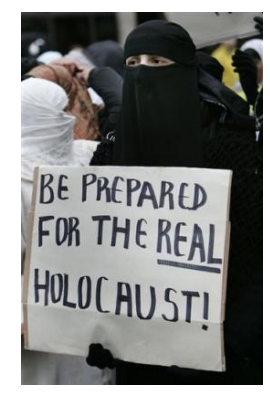
London, England: February 3, 2006