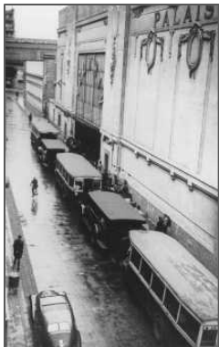
Buses outside the Vélodrome

On July 16-17 1942, "Operation Spring Wind" to deport the Jews in Paris went into action. The French Resistance learned of it in advance (perhaps from some police and government officials or resistance spies within) and warned some male Jews expecting that only men