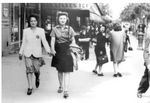
Two Jewish women in Paris.

In March 1942 the newly appointed SS police Chief Carl Oberg and his aide Karl Knochen began to dismantle Army offices