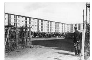
View of Drancy with French gendarme on guard.