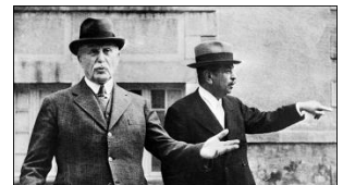
Pétain and Laval.

Vichy was a reactionary military movement blaming the ills of France on Jews, modernity, and the Enlightenment and not the failure of the military elite. This was an echo from post-World War I Germany. Pétain argued for “an intellectual and moral revival” 14 of the French nation. In his view, the nation had been corrupted by the liberal