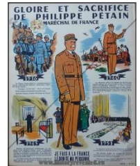
The myth of Pétain - circulated after his death in 1951.

According to historian Henry Rousso, De Gaulle had a complex relation to the memory of Pétain. 67 De Gaulle was seeking a new national revival that focused on values that echoed Vichy. Many gravitated to those values and to the memory of the "hero of Verdun." De Gaulle shrewdly praised Pétain when seeking votes and defended him as a hero who the Vichy tried to act as a shield in defense of France. In this framework, Vichy had been powerless under the Nazi yolk and Pétain served France by salvaging what he could while still maintaining parts of the empire in North Africa. This, of course, was classic Vichy propaganda, but also marginalized the Resistance more. At other times de Gaulle claimed the mantle of leadership in fighting the excesses of Vichy.