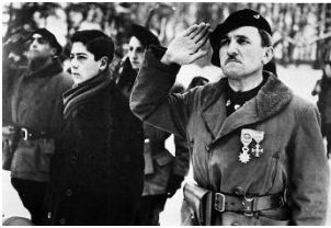
Joseph Darnand, leader of the Milice.

Regardless of judging its effectiveness, the Resistance did occupy German and Vichy leaders with a growing unease and forced them to focus resources to combat it. With growing failures caused by its refusal to negotiate with Vichy and a growing lack of enthusiasm from the police, the Nazis were forced to work with more extreme Vichy officials whose fascist leanings made them more natural allies. SS Klaus Barbie headed the feared Gestapo in Lyons. The Nazis relied upon different French groups to help combat the Resistance. Les Brigades Spéciales (BS) was a unit within the French Police recruited to fight the FTP-MOI. With about 200 zealous volunteers they were especially effective capturing more than 1500 young fighters. 53 The