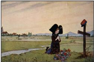
Illustrating the piety of Alsace by Jean-Jacques Waltz

In France women were generally seen as vulnerable – to be protected by men. Women were viewed as minors under protection of father or husband. The ideal woman was "pure" and a supportive helpmate to her husband. Therefore, independent women or women who had children out of wedlock, were perceived as "impure" and immoral. To "protect" women from the decadence of the Enlightenment, Vichy revived a 1907 law that had given women control over the money they had earned, restricted the right to divorce, criminalized adultery, punished abortion (with penalties including the death penalty), and imposed prison terms on those who abandoned their children. The number of women sent to prison for abortion quadrupled from 1938-1941. 17