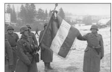
French soldiers in Russia, November 1941

On August 27, 1941, Laval and Déat were in Versailles at a send-off of the Legion des Volontaires Français contre le Bolshevism (The French Volunteer Legion Against Bolshevism or L.V.F. for short). A PCF attack wounded Laval and Déat. On August 28 Le Petit Parisien reported that “The attack had been the hallmark of an Anglo-Judeo-Soviet crime” and described the Free French as “the valets of Judeo-British capitalism.” 35 Not long afterward, on September 11, 1941, Charles Lindbergh speaking to the America First movement stated: “The three most important groups who have been pressing this country toward war are the British, the Jewish and the Roosevelt administration...I am not attacking either the Jewish or the British people. Both races, I admire. But I am saying that the leaders of both the British and the Jewish races...for reasons which are not American, wish to involve us in the war.” 36 The SS also reacting to the assassination attempt on Laval.