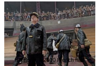
Still from 2010 French film, La Rafle.

The French police were complicit. Throughout the occupation, 90% of the deportations were conducted by the police. 41 4500 French police organized and conducted the "Vél d'Hiv" roundup. 42 French police had collected and maintained files on Parisian Jews. There were no Germans to be seen. In fact, they did not have the necessary manpower.