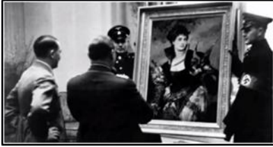
Göring gives Hitler a looted painting, Hans Makart's "lady with a falcon."

carpets to Hitler who put them down in the Eagles' Nest. Hitler, pleased with Abetz' work, intervened and gave the SS power to confiscate Jewish property. By early July 1940, General Keitel, Chief of the Armed Forces High Command, informed his commanders that the Führer had determined that the Gestapo would search libraries, archives and Masonic lodges for "enemy materials" in order to confiscate them. It was the first blow to the Wehrmacht's power in France. The Pétain government protested Abetz's work in late October, but Hitler ignored the protest and instead rewarded Abetz by confirming him as the German ambassador to Paris (Vichy) in charge of all political affairs in November 1940.