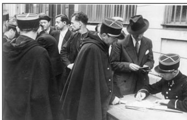
Registration of Jews, August 1941