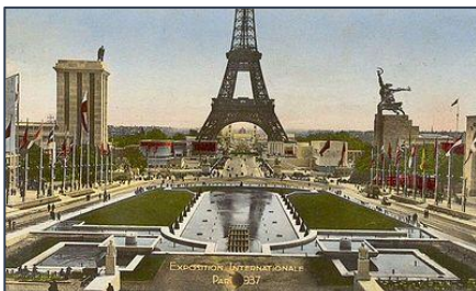
Nazi Germany and Soviet Russia pavilions.

When the Popular Front banned many Right-wing groups, they radicalized. By the mid-1930s Mouvement Social Français had more members than the Socialist and Communist parties combined. They mobilized proportionally more citizens in France after 1936 than the Nazis had in Germany before 1933. They mostly worked through intellectual circles and in writing as they, and the French Right, were never comfortable with the paganistic violence of the Nazis. In February 1936, they assaulted Léon Blum, the Popular Front (FFP) premier. Supported by high ranking military leaders, Mussolini and Franco, they carried out assassinations and bombings and tried to implicate the Communists. They blamed the rising political violence (that they instigated) on the Left and claimed the government was seeking to suppress their democratic liberty. In comparison to the Nazis, French fascism was generally more theatrical than dangerous.