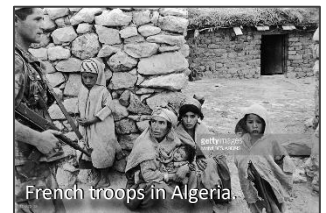
French troops in Algeria.

Resistance and minimizing Vichy were the continual themes of French memory. Gaullists and communists both wanted to exaggerate the scope of the Resistance, but with different agendas. De Gaulle believed he symbolized the Resistance continuing the tradition of uniformed soldiers fighting the thirty years' struggle for France in the tradition of Verdun. He represented a certain idea of France that placed the resistance within a continuum of French experience and not as something unique during the occupation. Vichy was explained as a handful of traitors to that national ideal. For communists, then marginalized, they did not want the memory of their sacrifice forgotten or whitewashed. The Resistance for them was a popular nation-wide movement against representatives of Vichy bourgeois power. It was agreed that the memory of Jean Moulin could fulfill the needs of both sides. In 1964 his remains were transferred to the Panthéon in Paris in a ceremony that focused on de Gaulle, while also, although clearly in a supporting role, referencing individuals from the Maquis. Even though each Resistance movement had its own heroes and Moulin's unifying leadership existed only for a short time, the ritual worked. It reinforced de Gaulle's role (Moulin had worked for him) while also resurrecting the memory of the resisters. It was a reductionist, but useful myth and mobilized the past for a political purpose that emerged out of conflict in the remnants of the French empire in Africa.