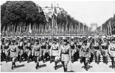
Bastille Day, 1939. A confident and well-equipped French Army parades in Paris.

Meanwhile, Gamelin reassured by the captured German plans, planned to invade Belgium with seven motorized infantry divisions when the Germans attacked. French tanks, superior to the Germans (integrated into the infantry divisions rather than formed as mass, independent units) were to be utilized to fight a defensive war of attrition once they arrived in Belgium. The “Escaut Plan,” formed in January 1940, was opposed by Gamelin’s own staff, but envisioned the Maginot Line acting as a buffer to channel German forces into Belgium. However, with no reserves over a 500-mile front, French tanks used only to support the infantry (radios were forbidden in the tanks), a plan for total command and control from the rear, and little if any communication with the generals in Paris, the French military was marching into a trap. Gamelin was to lead the French army by consulting only a few colleagues, never visiting the front, and issuing decrees without