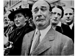
A Frenchman weeps as German soldiers march into Paris, on June 14, 1940. Note how the humiliation of the male reinforced France's sense of disgrace.

Reestablishing "family values" and "proper" gender roles were high on the agenda. Rather than facing their own incompetence, Vichy leaders assigned blame for France's defeat squarely on women. The nation, they asserted, had lost its male vigor and believed the declining birthrate (a result of the massive battlefield casualties of the First World War) were due to women entering the workforce. Laws against abortion and contraception were passed quickly. This was also seen in terms of negative "Jewish influence" over the "traditional" culture of France. Again, this was an absurdity as communists, Jews, and other targeted groups had served France faithfully and bravely in the war.