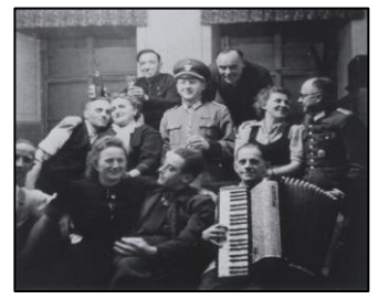
Hadamar Institute personnel socializing, between 1940 and 1942.

In December 1939/January 1940, eight pratients in Brandenburg are gassed with carbon monoxide in a "demonstration" to prove this method is more effexctive than the use of drugs. Nazi Party dignitaries write up a report to Hitler and Hitler writes back to approve gassing. T4 engineers will innovate with the invention of gas chambers and crematoria and disguises them as showers. T4 establishes six killing centers (only 4 operate at a time). Brandenberg, for example, closes in July 1940 because the crematoria smells. Fear of local responses of relatives lead to closing of Brandenburg and Grafenech.