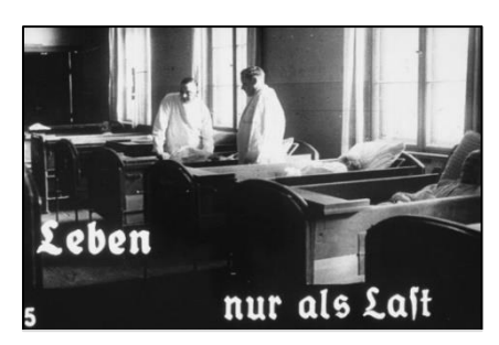
Slide of doctors working at an asylum for the mentally ill. "Life only as a burden." Germany, 1934.

In February 1935 a meeting is held, "Ways of solving the [Rhineland] bastard question" to deal with German citizens born to unwed mothers who had relations with black French soldiers. The Nazis have located 385 children, 370 of whom are children of French soldiers (learned from the 1933 compulsary registration of "hald breeds"). Facing the German civil law constraints that sterilizations have to be voluntary, the committee wrestles with possible solutions. Should they create a new law? No, possible public debate might bring a backlash. Should they ask doctors to sterlize them, but have them make up fake justifications or symptoms? At this stage, they are not sure they can trust doctors. Can they deport them? The Foreign Office reports that other countries will not accept them. Significantly, tying black race prejudice to the "Jeiwsh problem" the committee wonders if the laws and perhaps deportation can be applied to Jews.