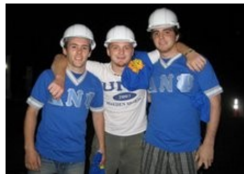
Members of Psi Upsilon, formerly Delta Nu Psi, at the Extreme Makeover Home Edition Set last Fall