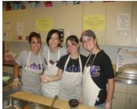
Members of Delta Phi Epsilon at the Community Kitchen