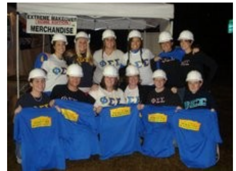
Phi Sigma Sigma Women at the Extreme Makeover Home Edition Set last Fall