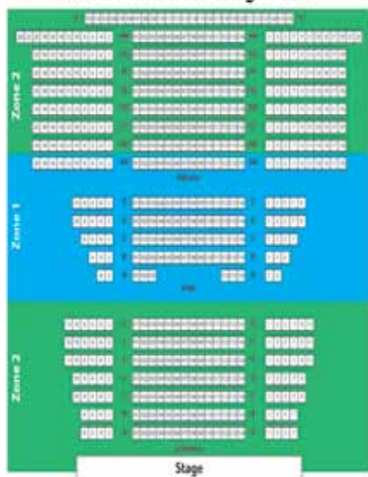
Main Theatre Seating Chart