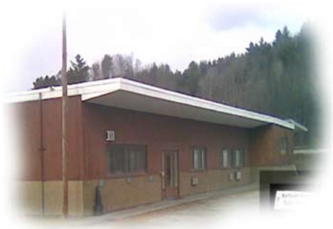
Northeast Regional Safety Academy in Montpelier, Vermont