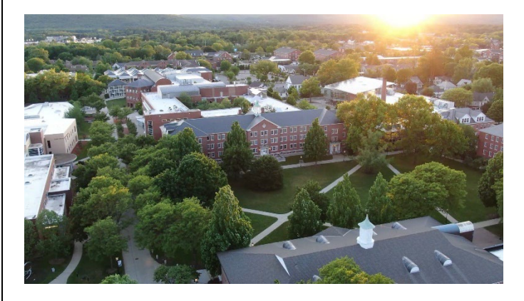
Keene State College Tobacco/Smoking Policy

When it comes to determining if a fire was the result of arson, Campus Safety will work with the Fire Prevention Officer within the Keene Fire Department.