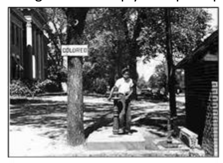
Halifax, North Carolina, April 1938

sent to labor mines (such as the horrific Pratt mines in Alabama eventually controlled by U.S. Steel) and facing certain conviction, many blacks agreed to a kind of plea bargain where they would confess and sign a contract to work out compensation through labor. In this way, blacks could stay close to home, but were then returned to their previous tenant or sharecropping farms as uncompensated convict labor. These sentences were often accompanied by brutal mistreatment including chaining and beatings. When their labor debt was paid new charges were simply trumped up (violating racial etiquette being a favorite) and the same railroading through