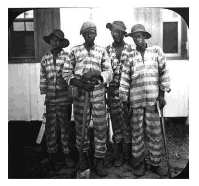
Convicts leased to harvest timber.

defendants were paid from specific fees charged to those accused of criminal behavior. Each official act (serving warrants, making arrests, court fees, and even the fees to ship them to convict labor sites) had a cost that was assigned to the accused. This was in addition to whatever settlement a judge levied in a particular case. The original point of this system was to ensure outcomes between neighbors in rural settings where jails were expensive and impractical. Disputes were often solved when one party agreed to pay off a debt with a contract of labor. Thus criminal courts were often used in civil disputes where labor was treated as currency to pay off debts. In 1929 Missouri sheriffs reported making between $20,000 and $30,000 each in extra compensation for securing black laborers and selling them to local planters.<sup>20</sup>